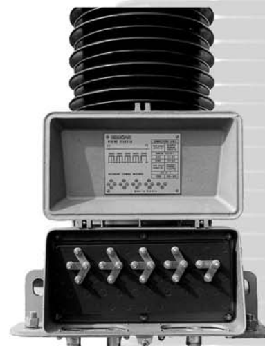
Secondary terminal box